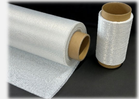
"ALCELON," a high-performance heat-resistant fiber