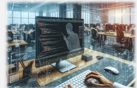
Note: Image generated by artificial intelligence (ChatGPT).