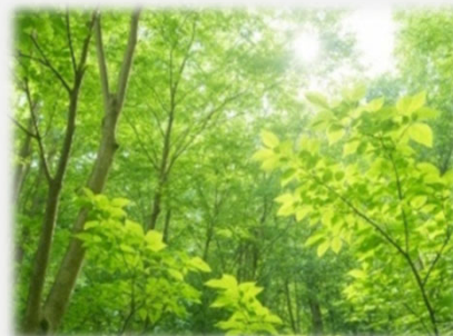
Note: Image generated by artificial intelligence (ChatGPT).