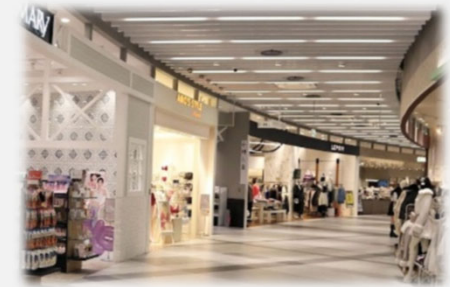
Increased freshness of facilities due to tenant replacements and enhanced in-facility environment (COCOON CITY)