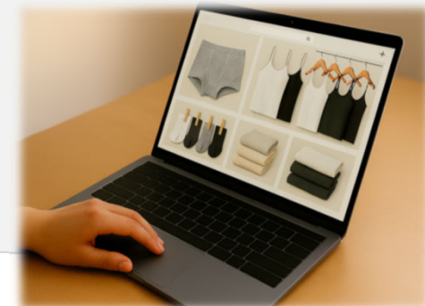
Note: Image generated by artificial intelligence (Copilot)